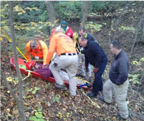
Low Angle Ropes